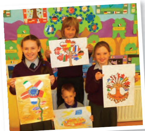
Irish Logo winners